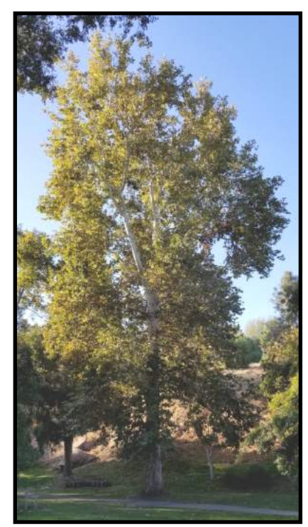
California sycamore, Platanus racemosa

As the new Gardens Manager, I have walked all the trails and seen most of the plants. There is a lot to see and experience, which wonderful, but it may also be difficult for first time visitors trying to choose a place to start. Fortunately, my first visit is still fresh in my mind and I will point out a few specimens that caught my attention that day.