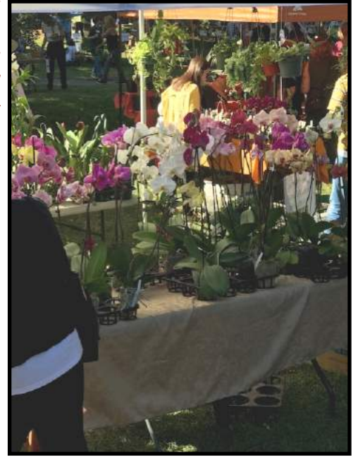
Orchids at the Garden Market & Plant Sale

help! We look forward to having even more UCR Panhellenic and club support at future plant sales.