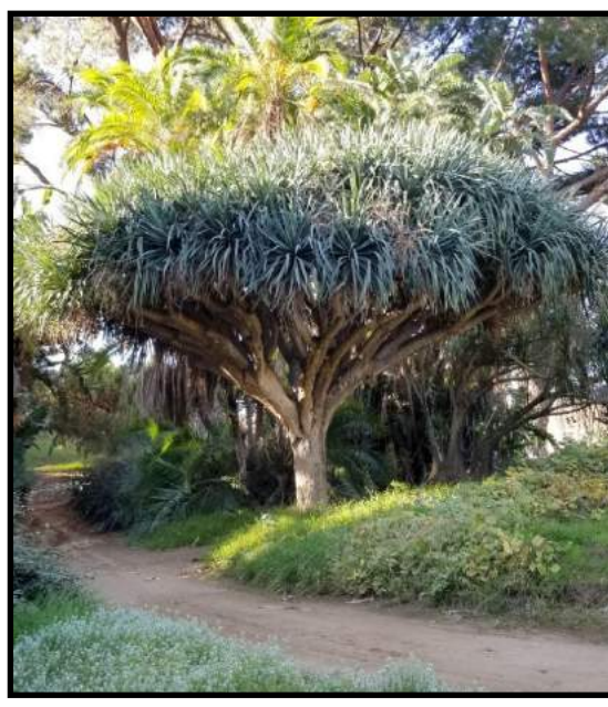
Dragon tree, Dracaena draco

I continued my exploration past the Baja California section where I spotted the next impressive plant in the collection. The dragon tree (Dracaena draco) stands with thick branches and is