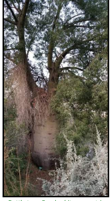
Bottle tree, Brachychiton rupestris

Whether you're looking to be impressed by size, aesthetics, or just an odd appearance, these recommendations are a good place to begin.