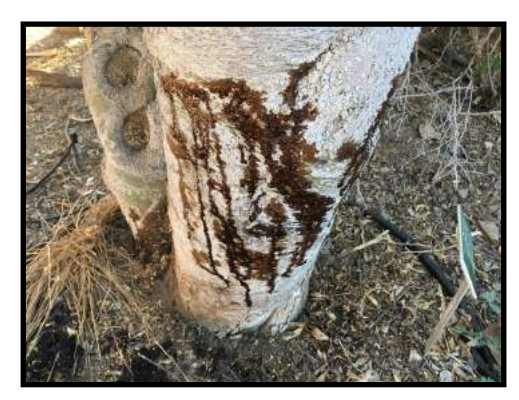
Shot Hole Borer damage on a tree