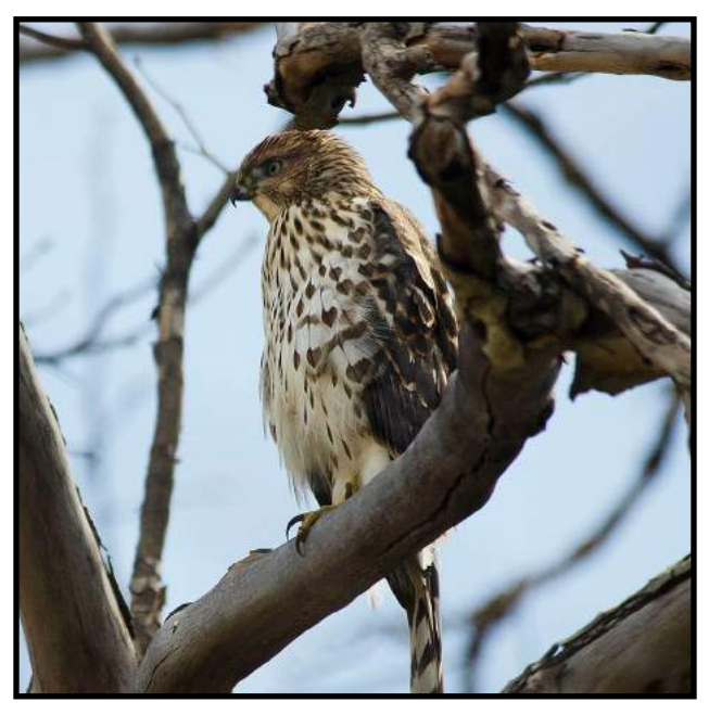
Juvenile Cooper's Hawk

The Cooper's Hawk is a medium sized bird, about the size of an