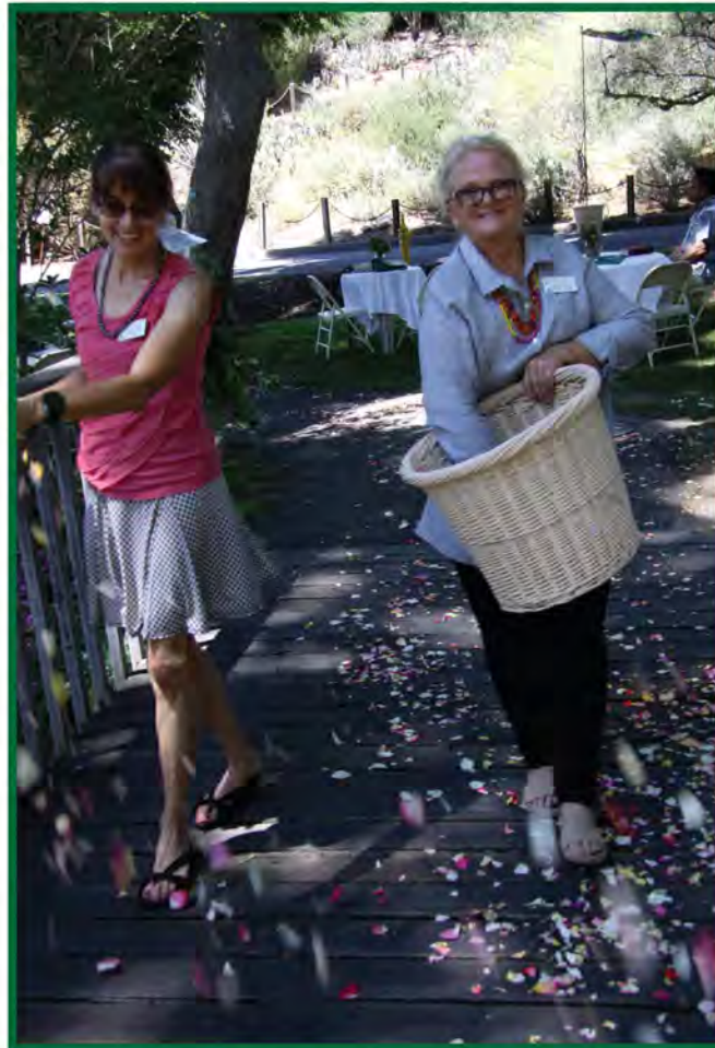
Spreading rose petals on the pathways for Primavera

W e have had a very busy spring in the Gardens, with many events and activities for everyone to enjoy. In March we had a presentation by Ann Platzer on Creating a Wildlife Habitat . Participants of this talk and garden tour were treated to a presentation that was full of good information on creating a wildlife habitat. The presentation included video clips and many 'before and after' photos, showing what progress can be made. Ann gave many tips on planning your garden with wildlife in mind and provided handouts for everyone to take home. Following the presentation we all received a tour of Ann's own amazing garden. Ann's husband Ed was there as well, handing out samples of macadamia nuts, citrus and even seeds to take home. Everyone left with plant cuttings, fruit, mosquito fish and much more! Everyone was so impressed with the garden created by Ann and Ed, and left with many ideas to apply to their own gardens. We expect there will be many new wildlife habitats created as a result of this class.