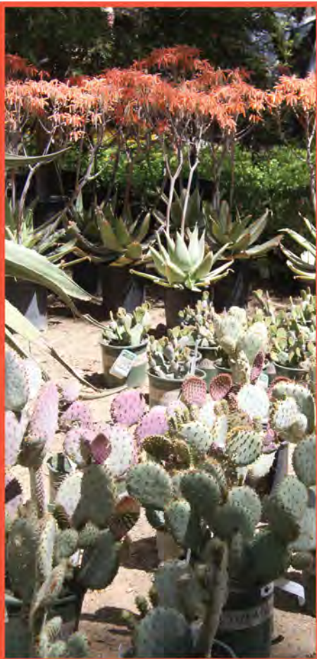
Some of the many plants offered by Paradise Garden Center at our Spring Garden Market and Plant Sale.

Gardeners were also there with a wonderful selection of vegetables, herbs, and flowers. We heard very good feedback from the crowd of shoppers and volunteers and overall, its inaugural debut went very smoothly. Taking note of anything we saw that needed changing and of all the suggestions that were given to us, we plan on this fall sale being even better. We will also have more of our own propagated plants this fall since many weren't ready by the spring sale. Mark your calendars for October 21 & 22 for the Fall Garden Market & Plant Sale.