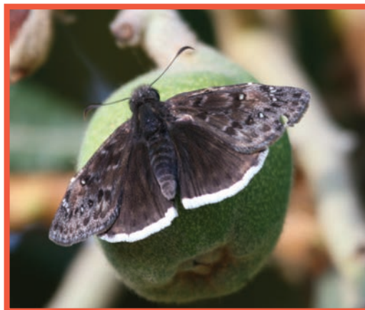
Dorsal View, Funereal Duskywing

The Funereal Duskywing butterfly, Erynnis funeralis , is small, with a wingspan of only 1 1/8 - 1 3/4 inches. Like other members of the Skipper Family, Hesperiiidae, it is known for its rapid and agile flight, stout body, large eyes and short antennae. It has blackish wings with very