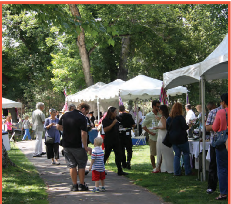
Primavera in the Gardens 2015

tremendous success, with a record number of people in attendance. For many people, the plant sale is their first introduction to the Gardens, so in addition to raising funds for maintenance of the Gardens, the event raises the profile of the Gardens in the larger community.