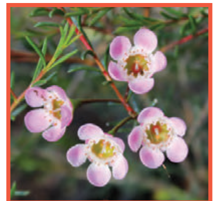
Chamelaucium 'Purple Gem', waxflower