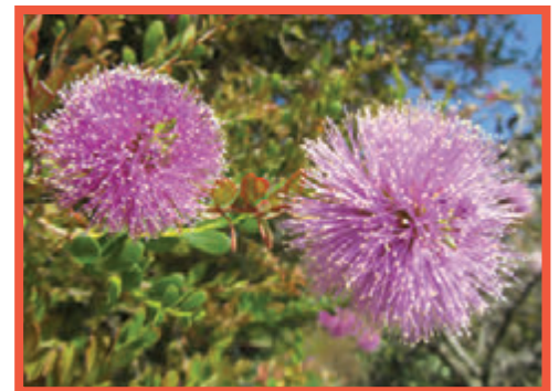
Melaleuca nesophylla, pink melaleuca, photo by Jvherlum

Among the other plants of Australian origin is pink melaleuca, Melaleuca nesophylla . This is a small tree or large shrub growing up to 20 feet