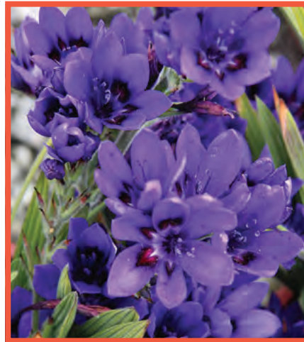
Babiana 'Deep Dreams', baboon flower, photo courtesy of Suncrest Nurseries, Inc., Watsonville, CA

Several bulbous plants from South America will also be available at the sale. Rhodophiala bifida , oxblood lily, comes from Argentina and Uruguay and is related to the amaryllis commonly forced into bloom at Christmas-time. It has narrow, strap-shaped leaves in winter and spring, and goes dormant