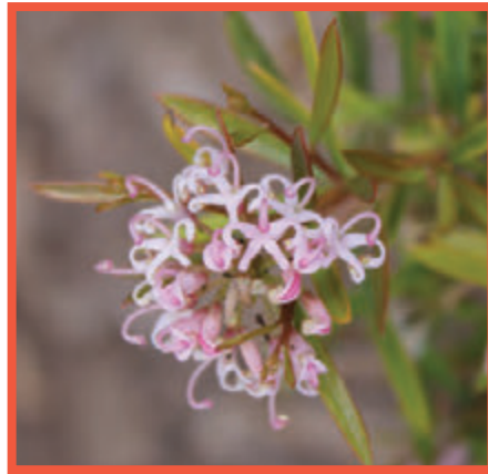
Grevillea 'Pink Midget', spider flower

colors, and with plants ranging in size from two to nine feet. The smallest is