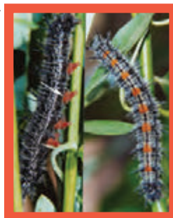
Photo 3. Mourning Cloak Larvae, with side and dorsal views

The female lays pale yellow/green eggs in large clusters of up to 250 encircling young twigs of its host plants which are mostly trees including willow, Salix spp, cottonwood, Populus spp., elm, Ulmus spp., and alder, Alnus spp. The larvae are gregarious throughout life eating leaves of their host plants. They are also striking with a dorsal row of large red spots on purplish-black bodies and bright red prolegs (see arrow on photo 3). The larvae are covered with dark protective spines that deter predators. When the larvae reach maturity, they usually wander away