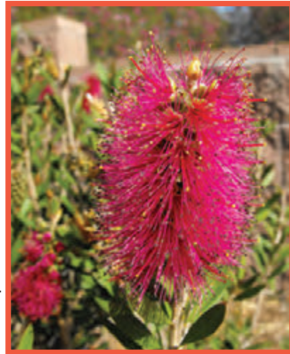
Callistemon citrinus 'Jeffersii', purple bottle brush

topping out at 18 feet or so in age. Since it is fairly slow growing, a more practical expectation might be eight feet tall and five feet wide. As the common name suggests, it has small, rounded, steely gray green "leaves" that are tough and leathery in texture. As with many acacias, what appear to be leaf blades are actually flattened petioles, called phyllodes. Like some of the plants discussed earlier, the flowers are composed of conspicuous stamens; these are bright yellow and arranged like a bottlebrush. The flowers are followed by attractive, rounded, bright green seed pods. Next in size, at four to six feet tall, is rosemary everlasting, Ozothamnus rosmarinifolius 'Silver Jubilee'. It is