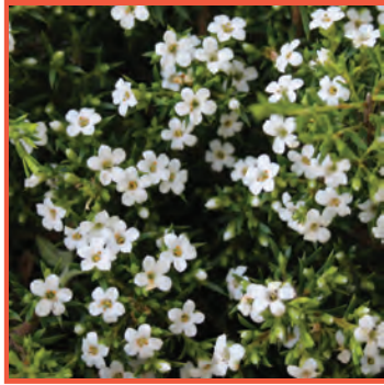
Coleonema album , white breath-of-heaven

at the sale. All have tiny, needle-like leaves and an abundance of small, starry flowers in winter and spring that are loved by butterflies. Their foliage is pleasantly aromatic when brushed. Growing to six feet tall and as wide are Coleonema album , Coleonema pulchellum and Coleonema pulchellum 'Magenta'. Coleonema album has white flowers; C. pulchellum has light pink flowers; C. pulchellum 'Magenta' has dark pink flowers. C. pulchellum 'Sunset Gold' has golden yellow foliage and pink flowers and grows from two to four feet tall and four to six feet wide. C. pulchellum 'Compactum' has pink flowers and is the shortest of the group, at three feet tall, but it can still spread to four to six feet wide. All require good drainage and moderate watering.