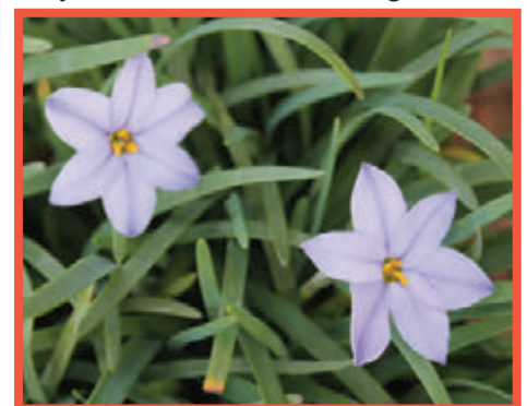
Ipheion 'Rolf Fiedler', blue star flower

uses are the lavenders and rosemaries. Two varieties of each are new to the sales and, of course, all have deliciously aromatic foliage. Lavandula x intermedia 'Romana', lavandin, has narrow silvery gray leaves and thick clusters of tiny lavender flowers on long, wand-