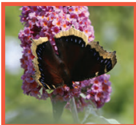
Photo 2. Mourning Cloak, adult dorsal

The Mourning Cloak is a large butterfly with a wing-span of about three inches. The dorsal wing surface