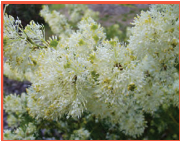
Grevillea 'White Wings', spider flower

Australia is a source of many choice water efficient plants and there will be plenty of these at the spring sale. Among the plants of Australian origin