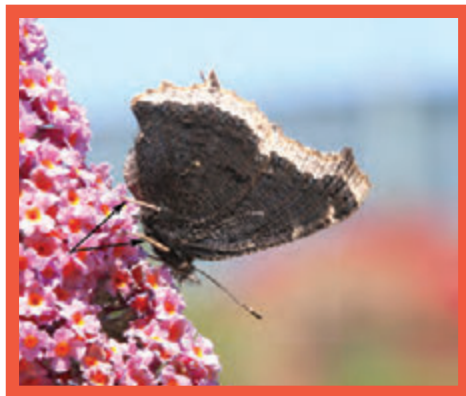
Photo 1. Mourning Cloak, adult ventral

They are called “Brush-Foots” because in both sexes the two forelegs are very small and covered with hair vaguely resembling a brush. The adults walk on only the four hindlegs as the forelegs are vestigial and useless for walking