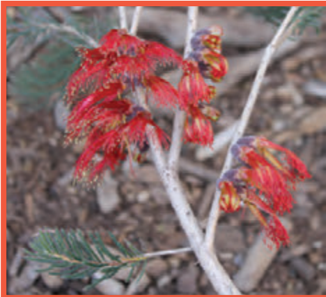
Calothamnus villosus , silky net bush

Like Australia, South Africa supplies us with many fine ornamental plants. Among these are members of the genus Coleonema , also in the Rue Family, and commonly called breath-of-heaven. Five types will be available