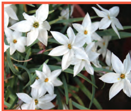
Ipheion uniflorum 'Alberto Castillo', white star flower

and leafless in summer. The flowers appear in late summer while the plant is still leafless. They are dark red, nodding trumpets, several produced at the top of