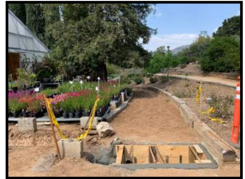
Drainage repairs near upper nursery