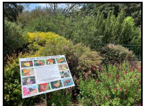
The Butterfly Garden