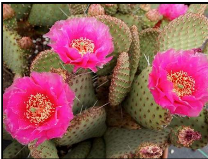
Opuntia basilaris , beavertail cactus

When we transition to a better time and we open our gates to our valued visitors, please include the Native American Garden in your places to see. The Native American Garden's beauty and purpose will patiently await your presence and appreciation.