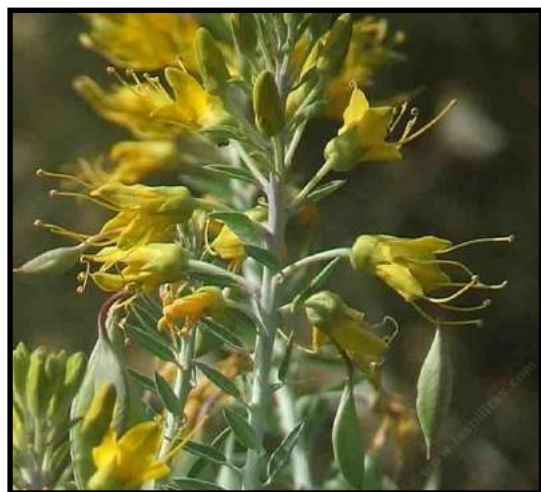
Peritoma (Isomeris) arborea , bladderpod

will reveal other plants in various areas of the UCRBG