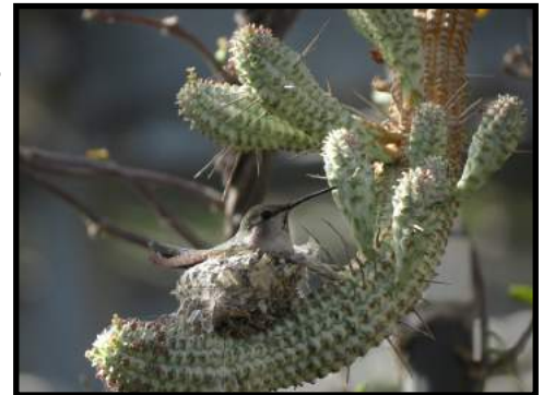
A hummingbird enjoying the quiet Gardens

When allowed by state and local authorities and UCR, Phase 2 will be launched with some restrictions eased but still following recommendations for facial masks, physical distancing, and group size and capacity limits.