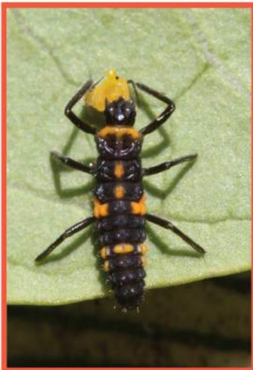
Photo 4. Ladybird beetle nymph eating aphid.

g a r d e n hose with moderate pressure to r e m o v e a p h i d s . H o l d t h e p l a n t (stems/leaves/flowers) with one hand as you spray all sides to r e m o v e a p h i d s