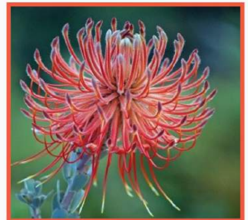
Photo 6. Leucospermum 'Red Rocket'

Not only are they a vendor but also a sponsor of the Plant Sale. They are located on Dufferin and Washington right here in Riverside and cover about 40 acres. Their specialty is desert specimen trees and succulents but they also have exotic palms and grow hundreds of varieties of shrubs, perennials, and California natives. They will be bringing a truckload of plants and since they're so close they can restock for Sunday! Some noteworthy plants they'll be bringing include about 8 different colors of the Buddleia 'Buzz' series which are a compact hybrid of the butterfly bush. They'll also bring a variety of salvias, Leucophyllum (Texas ranger), Leucadendron , Leucospermum and much, much more. One of my favorites he's bringing is Acacia cognata 'Cousin Itt' which doesn't require much water and looks beautiful all year (See photo 1).