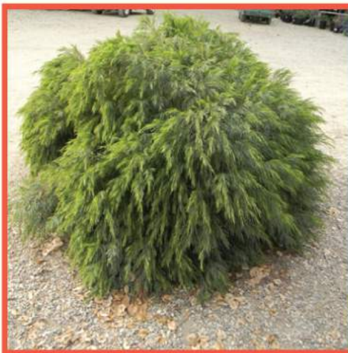
Photo 1. Acacia cognata 'Cousin Itt'