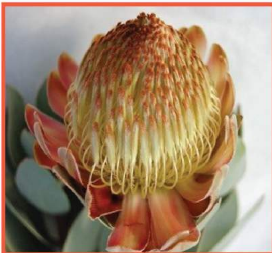
Photo 5. Protea 'Nitida'

first. We will still provide boxes and as many wagons and wheelbarrows as we have, but if you have one of those portable ones then you should bring it as always.