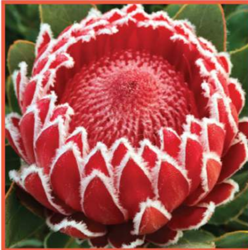
Photo 4. Protea 'Ceres'

Here in Southern California we have a Mediterranean climate along with