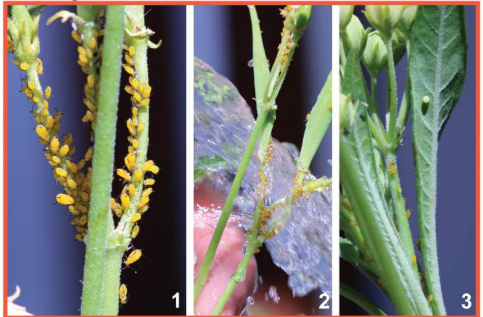
Photos: 1. Aphids on milkweed; 2. Spraying aphids; 3. Monarch egg persists after spraying.

(Photo 2: Spraying aphids). Not all the aphids will come off with the first spraying. Again, be persistent, and be sure to check that aphids are not hiding on the underside of