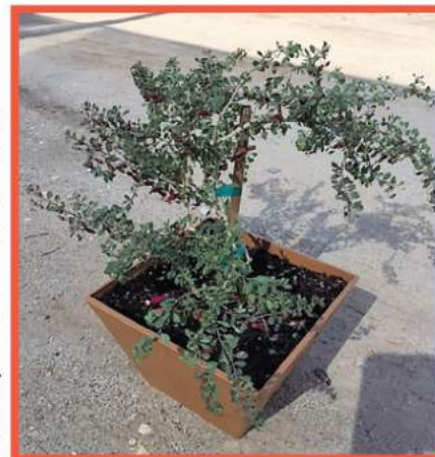
Photo 9. Eremophila maculata 'Valentine'

They are located on 50 acres in Arizona and everything they grow is water wise. We can expect them to bring favorites like Anigozanthos , Eremophila , Callistemon , Dianella , Grevillea , Alyogyne , Acacia , Melaleuca , and Eucalyptus . They also have potted bonsai with a variety of these plants. (See photo 9)