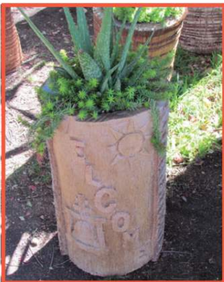
Photo 8. Stumps & Trunks

If you came to last year's Spring talk or outing or read the Summer Newsletter then you know who the Resendez Brothers are. They are a 100-acre flower farm located in Fallbrook, CA. They began in 1995 with proteas and over the years have expanded to include other exotic flowers mainly from South Africa and Australia, including Pteroccephalus (pincushions), Banksia , Anigozanthos (kangaroo paws), Leucadendron , filler flowers and foliage. If you are looking for unusual plants that provide excellent cut flowers, you'll want to stop by their booth. We have never offered the genus Protea before, so it's a real treat to have them as a vendor. They will also be bringing a variety of cut flowers to purchase. (See photos 2-6)