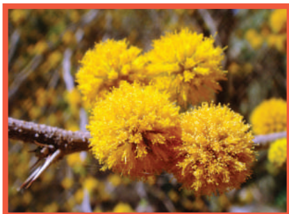
Sweet acacia, Acacia smallii

The days are cool, the air is fresh and it is a perfect time to bring new plants into our gardens. The fall plant sale is just around the corner, and as always, there will be more than 60 new plants—plants that we've never offered in its 30-plus year history—and lots of plants that attract hummingbirds and butterflies to your garden. Fall is the best time to plant most California natives, so now is the time to stock up on those. In spring we offer only the few varieties