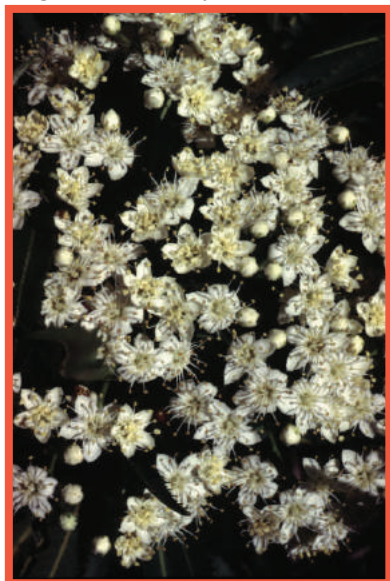
Guadalupe Canyon rosewood Vauquelinia californica var. pauciflora

Among the other water efficient trees to be offered are four oaks. Two are California native evergreens, coast live oak , Quercus agrifolia , and canyon oak , Quercus chrysolepis . One evergreen is from the Mediterranean: cork oak , Quercus suber . The