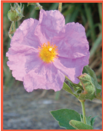
Rockrose, Cistus x Ralletii

Many buckwheats, Eriogonum , are also butterfly-attracting, California natives. There will be two herbaceous species of buckwheat: red-flowered buckwheat and sulfur buckwheat. At six to 18 inches in height, sulfur buckwheat , Eriogonum umbellatum . var. polyanthum ' Shasta Sulfur ', is the smallest of the two. It has spoon shaped leaves that are gray green above and felty white below. It produces fluffy heads of tiny, bright yellow flowers in summer. Red-flowered buckwheat , Eriogonum grande v. rubescens , grows to three feet tall. It has gray green, oval leaves that are lighter underneath, and many clusters of tiny, rose red flowers from spring to summer. Both grow to about three feet across. The giant of buckwheats, as its botanical name implies, is Saint Catherine's lace , Eriogonum