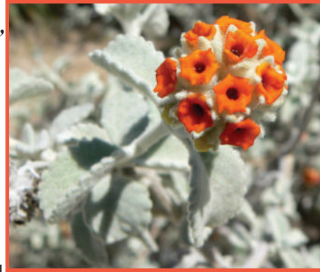
Woolly butterfly bush, Buddleja marrubiflora , photo by Stan Shebs

butterfly bush, Buddleja marrubiflora , that we've not been able to offer in some time. Friends will have to check out the plant list to read more about these and many other choice plants. Check out the box below to review all the ways you can get the detailed plant list. But even the detailed list can't include everything. There are still many cacti