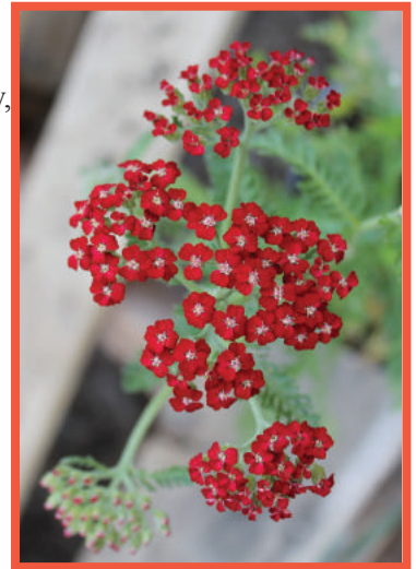
Common yarrow, Achillea millefolium 'Laura'

stemmed rosettes of narrow, silvery blue, toothed leaves with light spots. In winter and spring it produces tall, unbranched spikes of