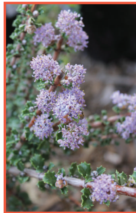
Ceanothus Blue Jeans

Several trees to be offered are of special interest. Dr. Ben Rangel, a UCR graduate and past Gardens employee, has grown for us a nice batch of sweet acacia , Acacia smallii . This large shrub or small tree looks dainty and delicate with its ferny leaves and fragrant, yellow puff flowers, but it is tough, heat tolerant and water efficient. It has spiny branches so consider this when placing it in your garden. Another heat tolerant and water-wise large shrub/small tree is Guadalupe Canyon rosewood , Vauquelinia californica var. pauciflora , which we are offering for the first time. This