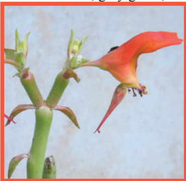
Slipper flower, Pedilanthus macrocarpus

tubular, coral red flowers. There will be five species of California native Dudleya available; two are new to the sales. One of these is Dudleya edulis , commonly called Mission lettuce , because the leaves used to be considered a delicacy. This is a Southern California native that forms multiple rosettes of narrow, gray green, pencil-like leaves. It bears branching spikes of fragrant, starry, creamy white to pale yellow flowers in summer. Also new to the sales is Dudleya farinosa , bluff lettuce . Bluff lettuce forms ground-hugging rosettes of broad leaves that vary from green to chalky white and are usually blushed red. It produces branching spikes of small, bright yellow flowers in summer. Slipper plant, Aloe 'Walmsley's Blue', Mission lettuce and bluff lettuce all are hummingbird favorites. As usual, there is only enough space in the newsletter to discuss a handful of the great selection of plants