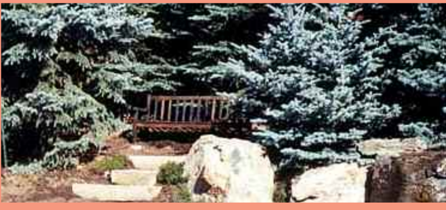
The Betty Ford Alpine Gardens

http://www.bettyfordalpinegardens.org/mtn-med.php