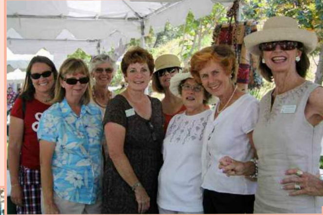
^ 13. Silent Auction Team