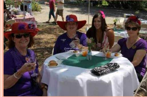
^ 5. Red Hat Ladies with friend