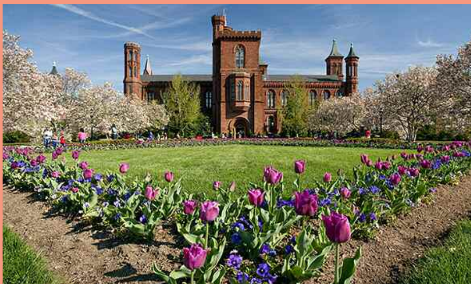
The Enid A. Haupt Garden, part of the Smithsonian Gardens.

*Sorry, The Huntington is not a participant in the program at this time. Gardens within 90 miles of your home garden have the right to exclude reciprocal memberships.