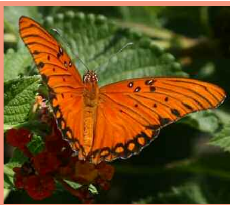
Gulf Fritillary.

blue passion vine, ( Passiflora caerulea ). It is very robust and has completely covered 25 feet of their chain link fence. Another robust host plant is Passiflora alatacaerulea . If you have an ugly fence, why not cover it with passion vines? The Gulf Fritillaries will reward you with their presence.