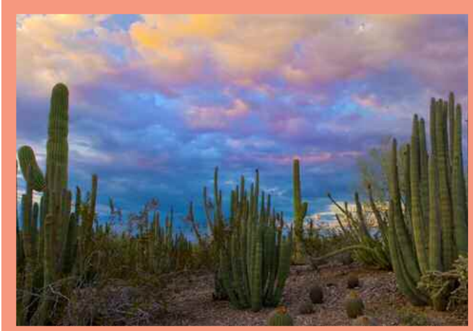
The Desert Botanical Garden.

Phoenix, Arizona – The Desert Botanical Garden dates back 70 years. Its mission is to teach and inspire visitors to protect and preserve the desert's natural beauty. The 145 acre Garden boasts 1,140 volunteers 104 staff members, and 26,065 member households! http://www.dbg.org/