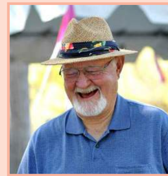
^ 14. Happy guest