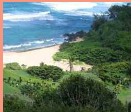
The Na Aina Kai Botanic Gardens and Hardwood Plantation.

more than 2.4 million plants (9,084 different taxa). These are displayed in a landscaped manner, showing ways they can be used in the visitors' own gardens. (Fabulous garden, no room for photo.) http://www.chicagobotanic.org/explore/ .