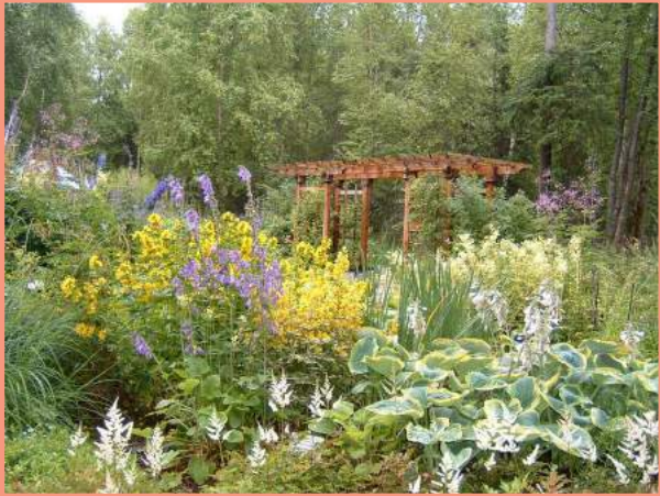
The Alaska Botanical Garden

Anchorage, Alaska – The Alaska Botanical Garden is a wonderful place for evidence of glacial activity and views of the Chugach Mountain Range. In summer, the Garden is great for bird watching, walking, hiking, photography, painting, or reading. In winter, take a quiet walk or ski through the forest. http://www.alaskabg.org/Visit/visit.html