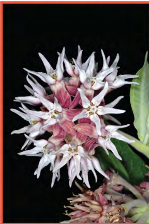
California showy milkweed, Asclepias speciosa , Photo courtesy of Doug Goldman, hosted by the USDA-NRCS Plants Database"

Among the California natives that are new to the sale are several handsome shrubs. Not commonly avail-