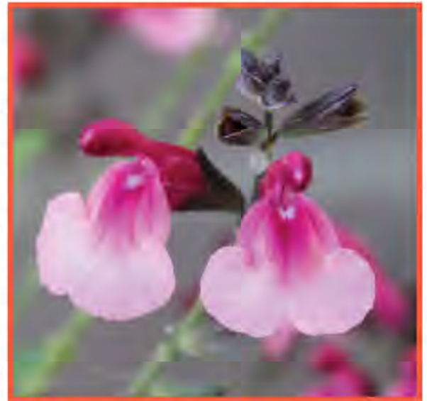
Autumn sage hybrid, Salvia x jamensis 'Ann Platzer'

As usual, succulents are a major feature of the plant sales and there will be plenty that we've not offered before. Three of these are in the Stonecrop Family. Cotyledon 'Happy Young Lady' is commonly