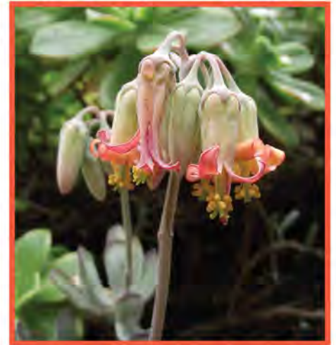
Finger aloe, Cotyledon 'Happy Young Lady'

The list of plants to be offered at the fall sale goes on and on. There is only enough space in the newsletter to discuss but a handful of the many varieties of plants to be available. There will be more than 100 California natives, alone. Also offered will be well over 110 varieties that attract hummingbirds and more than