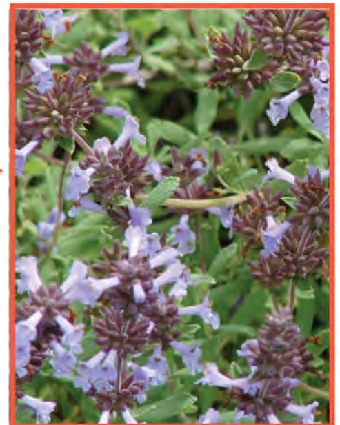
Munz sage, Salvia munzii .