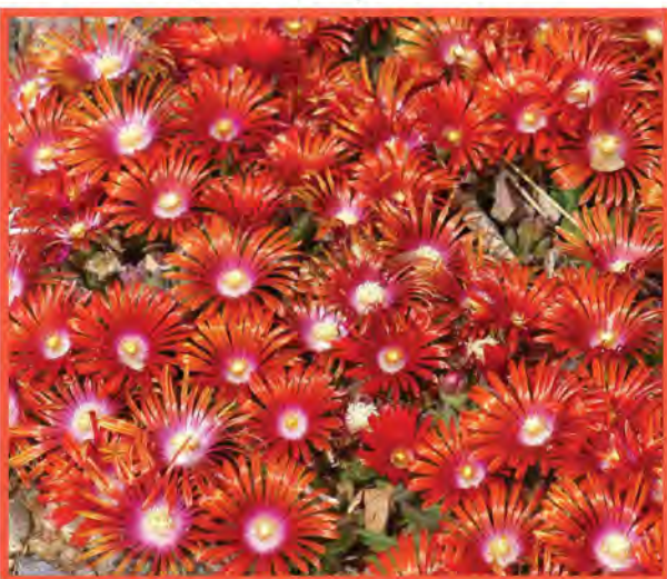
Red Mountain iceplant, Delosperma dyeri 'Red Mountain'