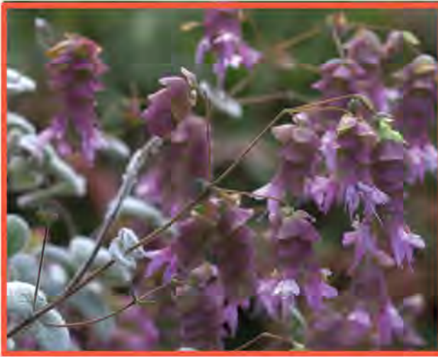
Dittany of Crete, Origanum dictamnus

260 species in this large genus, and a choice one it is. It is a spreading-shrub, growing one to two feet high and three to six feet wide and has narrow, green leaves. The tubular, flared flowers are blue-purple and are produced over a long spring to summer period. Hummingbirds love it.