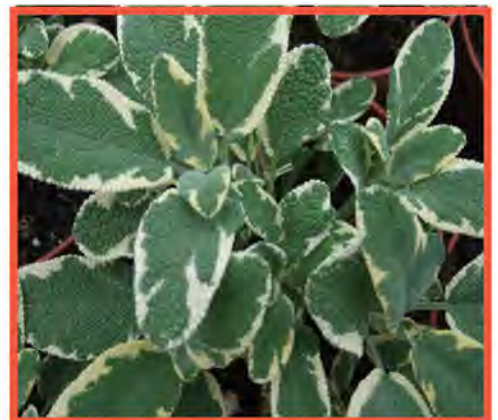
Culinary sage, Salvia officinalis 'La Crema'

We always have a selection of versatile, Australian native plants at the sales. New this sale is purple carpet emu bush, Eremophila densifolia . This is just one out of