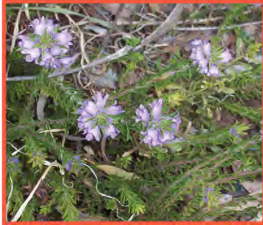
Purple carpet emu bush, Eremophila densifolia

wide. It has dark gray-green, textured, highly aromatic leaves and shish-kabob spikes of tiny, white, tubular flowers that attract butterflies, bees and hummingbirds.