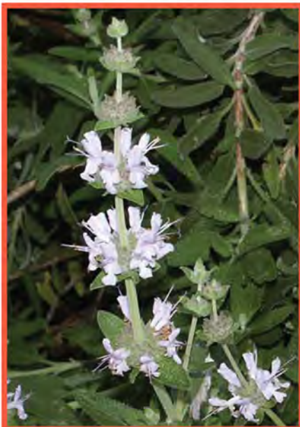
Black sage, Salvia mellifera 'Terra Seca'

Two shrubby, native salvias will also be offered for the first time. Salvia mellifera 'Terra Seca' and Salvia munzii 'Baja Blue'. 'Terra Seca' lives up to its cultivar name, which means "dry earth," by being especially drought tolerant. It is a low-growing, wide-spreading selection of black sage, less than two feet tall, but spreading to six or more feet