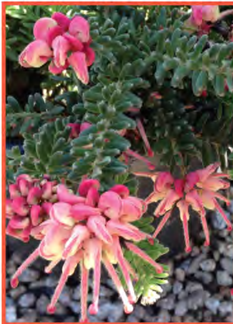
Woolly grevillea, Grevillea lanigera 'Mt. Tamboritha'