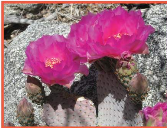
Opuntia basilaris, beavertail cactus