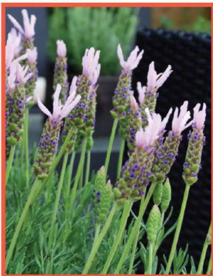
Lavandula pedunculata ssp. lusitanica 'Lusi Pink', butterfly lavender

From Europe and the Mediterranean come the sunroses. Related to rockroses ( Cistus ), sunroses are under-used in Inland gardens. These are mat-forming shrubs, good as small scale groundcovers, or spilling over retainer walls. A new one for this sale is Helianthemum 'Cheviot'. It forms a tight, spreading mound, six to 10 inches high and three feet across.