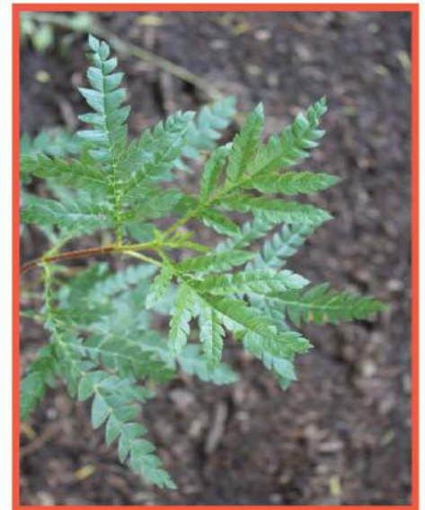
Lyonothamnus floribundus ssp. aspenifolius fernleaf Catalina ironwood

summer are produced small, white flowers with yellow centers in large, flattened clusters. It needs good drainage and occasional, deep irrigation. One doesn't usually think of trees when thinking of ceanothus, but Ceanothus 'Ray Hartman' qualifies. 'Ray Hartman' grows from 12 to 20 feet tall and can be trained as a large shrub or trained into a single- or multiple-trunked small tree. It has comparatively large, dark green leaves and spike-like clusters of