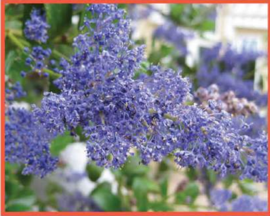
Ceanothus 'Ray Hartman'

tiny, medium blue flowers in spring. 'Ray Hartman' is just one of eight thus that will be available at the sale. The flowers of ceanothus, and fernleaf Catalina ironwood, are attractive to