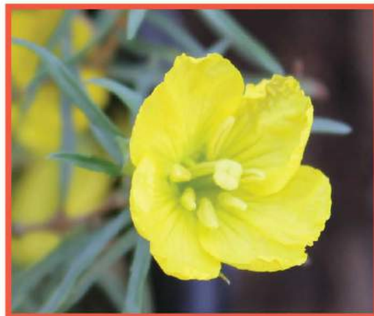
Calylophus hartwegii 'Texas Gold', sundrops

and two-inch, glowing yellow, poppy-like flowers produced spring to fall. Native to Texas and beyond, Callirhoe involucrata , or wine cups , is another heat-loving perennial. It grows from six inches to one foot tall and two to three feet wide. The stems are lined with round, deeply divided leaves. The two-inch, vivid rose purple, poppy-like flowers are produced from spring to fall in the warmer parts of its range. These close at night, but re-open in the morning if they haven't been pollinated. It is a larval host and nectar source for the Gray Hairstreak butterfly. Callirhoe dies down to a tuber in winter. Our next offering is native to Oklahoma and Kansas. Oenothera fremontii is also called sundrops and in the same family as Calylophus , above. The selection, O. fremontii 'Shimmer', will be available. Another heat-lover, this is a mounding perennial to about