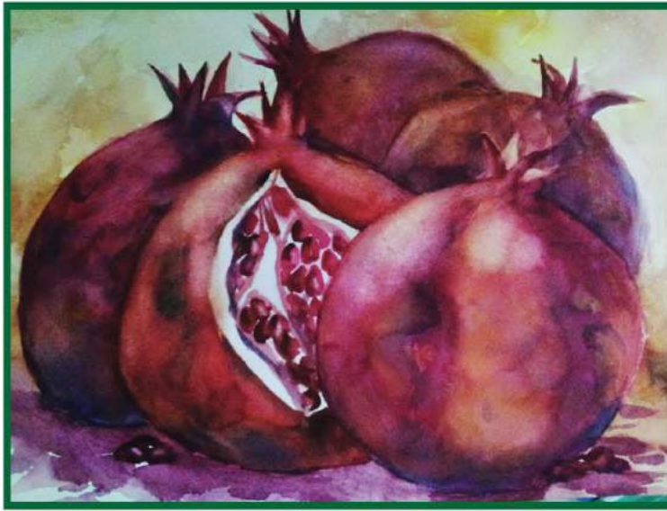
Watercolor by Arlene Moreno