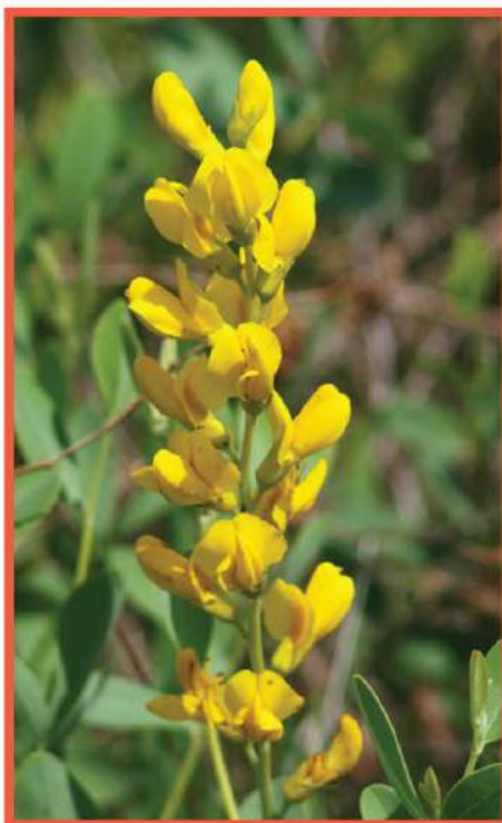
Baptisia sphaerocarpa , Yellow wild indigo

The leaves are small and silvery gray and the one-inch, five-petaled flowers are apricot orange with a golden tuft of stamens in the center. Shearing it lightly after it blooms will encourage a second round of flowers. Also from the Mediterranean comes butterfly lavender , Lavandula pedunculata ssp. lusitanica 'Lusi Pink'. 'Lusi Pink' is related to Spanish lavender and is similar. It is a three-foot mounding shrub with narrow, aromatic, gray-green leaves. The tiny, dark blue-purple