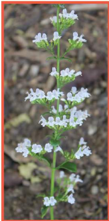
Calamintha nepeta ssp. nepeta , calamint

the sales and this sale will be no exception. New to the sales are two that deserve special mention. Growing to only a foot or so tall in bloom, Aloe 'Pink Blush' is a cute miniature, great for containers or in a well-drained garden site. It forms spreading clumps with many rosettes of stiff, tapered leaves that are dark green but almost completely covered in raised, greenish white dashes; the leaves