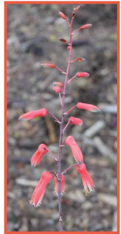
Aloe 'Pink Blush'

years of work and dedicated service to the Gardens. Besides being easy-to-grow, this is a beautiful plant. It forms spreading clumps one or two feet high and of indeterminate width. The paddle-like stems are an attractive pale sea green, sometimes blushed purple, and the many-petaled, satiny, rose purple flowers are truly spectacular. This cactus has no long thorns, just tiny, hair-like "glochids." As with most cacti, it requires good drainage.