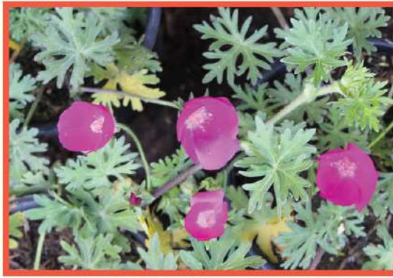
Callirhoe involucrata , wine cups