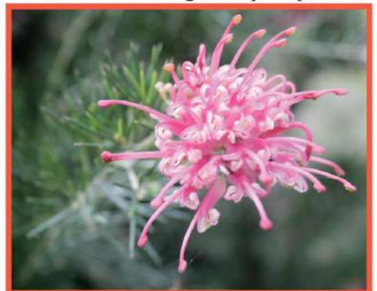
Grevelia 'Pink Pearl'

viminalis , is the selection Callistemon viminalis 'Macarthur'. 'Macarthur' is a dense, rounded shrub growing to only six or seven feet tall (which is several feet taller than the more common, 'Little John') and requires little or no pruning to keep it compact. It has narrow, blue-green leaves and typical, blood red, bottlebrush-shaped flower clusters; these are produced fall, winter and spring. Two grevilleas will also be offered for the first time. The larger of the two is Grevillea 'Pink Pearl'. 'Pink Pearl' is a dense, mounding shrub to six feet tall, or so, and has bright green, needle-like leaves. The unusual, spidery flowers are rose pink and are born at the branch tips. These are produced most heavily in spring, but can appear intermittently though the rest of the year. The smaller grevillea, at only one to two feet tall, is Grevillea lanigera 'Mt. Tamboritha', a selection of woolly grevillea. It has small, gray green leaves that are packed fox tail fashion along arching or trailing stems. The spidery flowers are pink and cream in color. As with many Australian plants, grevilleas should not be given phosphorus