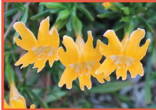
Mimulus bifidus 'Junipero Serra' monkeyflower

Another first-timer is Mimulus bifidus 'Junipero Serra', one of a number of plants called monkeyflower . This is a shrubby perennial with narrow, dark green, sticky leaves and an abundance of trumpet-