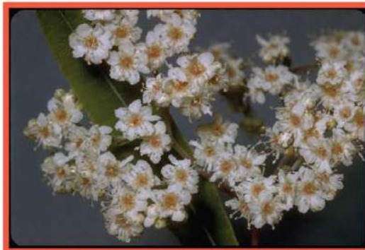
Lyonothamnus floribundus ssp. aspenifolius fernleaf Catalina ironwood

We'll give you one guess as to what is on every Southern California gardener's mind, and what is the focus of this plant sale review. You guessed it -- drought! Even without mandatory water use reductions, the conscientious gardener will want to help to conserve water by using water efficient plants wherever possible, but now saving water is mandatory in most areas. Obviously, one way of reducing our overall water use is to use more water-thrifty plants. People sometimes think that gardeners who are limiting their gardens to water-efficient plants are depriving themselves, but the palette of water efficient plants includes some of the most beautiful and unusual plants that we can grow. The sale will have a fine selection of these low-water-use plants of all shapes and sizes and for all situations. Within the water-efficient selection of plants discussed, the focus here will be on plants that are new to the sales. There will be over 50 varieties of plants offered for the first time. And, even with water