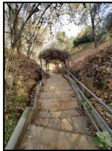
Arbor steps below the pond