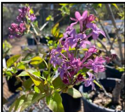
Syringa x hyacinthiflora 'Ramona'

Lilacs, Syringa – Lilacs are deciduous shrubs with deliciously scented flowers in spring. They are usually associated with cold winters, but these selections all bloom well in the Botanic Gardens. Five varieties will be available, Gertrude Leslie, Red Pixie, Ramona, Burgundy, and Libby Erickson. They will do best in partial to full sun.