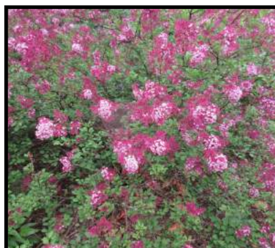
Syringa 'Red Pixie'