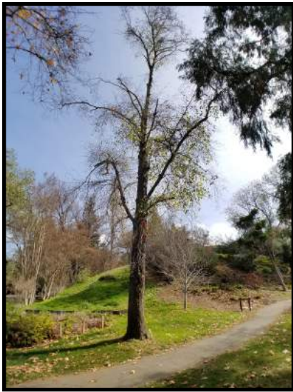
Alnus rhombifolia , white alder

In a short time, soil temperature will rise and daylength will increase, and the subtle changes will signal to thousands of specimens to increase their activity. Trees and shrubs that have shed their leaves will once more produce new foliage to capture the necessary energy to sustain their growth and build up stores for next Spring's push. You don't have to walk far to see this. In our Deciduous Forest and Alder Canyon we have over 25 trees that will leaf out soon. Though this may not be as beautiful as flowers painting a hillside, it is remarkable to know that next year's success depends heavily on the current year's leaf production. Whether through stress or age, which can limit the number of leaves and/or leaf size, leaf production can have a severe impact on plant photosynthetic capacity. At some point in the life of a plant, energy expenditure for maintenance will be greater than what is captured, leading to decline and the eventual death of the plant.