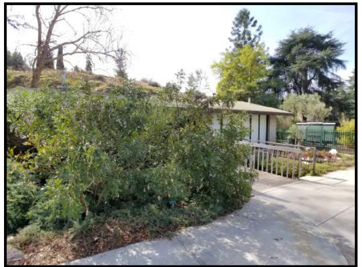
Sophora secundiflora , Texas mountain laurel

itself in a rock. What was once a small foothold for this tree has grown with the thickening of the trunk and root diameter over time. Though the roots are in soil, the way the tree is situated it appears as if it is growing from rock itself. My last recommendation is a favorite among our visitors. Sophora secundiflora , Texas mountain laurel, typically grows as a multi-trunked shrub, slowly reaching a height of about 10-15 feet. What sets this apart as a favorite is the scent the hanging bluish-lavender flowers produce. Many visitors have told me that they can smell this plant from the parking lot and that it reminds them of grape soda. These shrubs are only a short walk from the entrance and are found near the first and second bridge. Visit soon and experience this delightful plant for yourself and see why so many visitors rave about it.