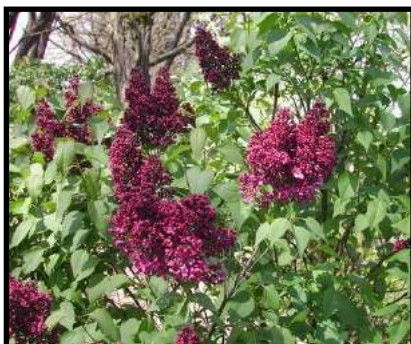
Syringa vulgaris (Burgundy)