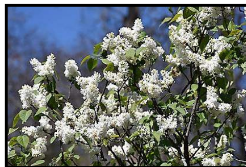
Syringa x hyacinthiflora 'Gertrude Leslie'