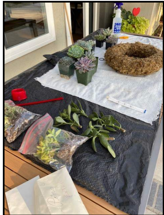
The set up