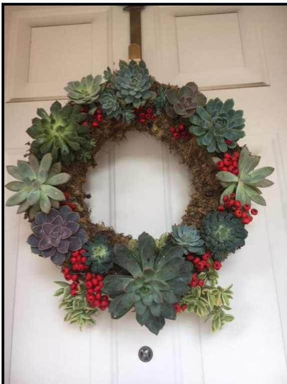
The beautiful final product!