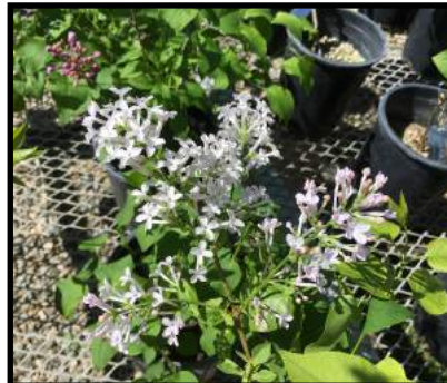
Syringa oblata 'Libby Erickson'