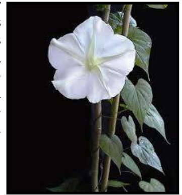
Ipomoea alba , morning glory vine

game was almost certainly in the coastal lowlands where latex-producing trees were common. Archeological evidence shows that the practice of playing ball figured prominently in the culture of the Olmec, Mayan, and Aztec civilizations and has persisted in some form from its beginnings around 1600 BCE to the present. In fact, the name "Olmec" means "rubber people."