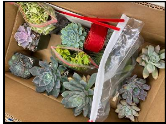
The supplied kit