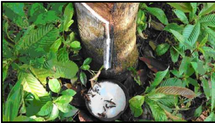
Collecting latex from Hevea brasiliensis

When we think of rubber trees, we are probably thinking of the great tropical forests of South America, southeast Asia, and even Africa and India. The most common commercial rubber-producing tree in those areas has been Hevea brasiliensis . Rubber, however, can be produced from the latex of a variety of trees of different species and even families, some of which can be seen at the Botanic Gardens. Latex alone can be used for certain adhesive effects, but to produce rubber latex must be mixed with the juice of another plant, Ipomoea alba (morning glory vine), which grows in abundance in the same environments as rubber trees. The story of how the mixture of latex and morning glory juice was discovered and refined is one of the most fascinating episodes in the history of civilization and man's use of and reliance on plants.