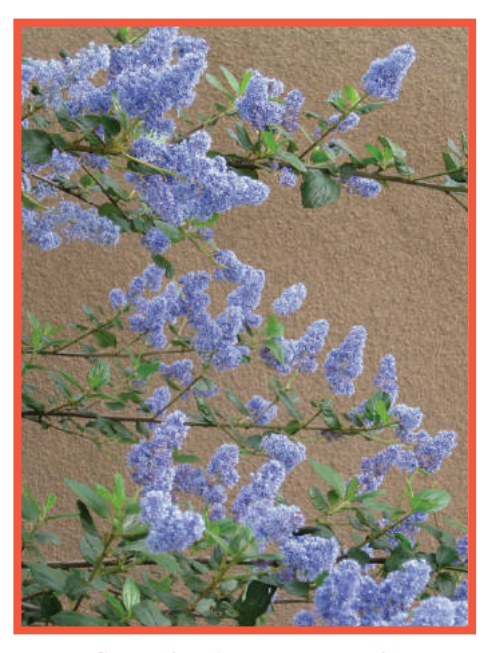
Ceanothus 'Ray Hartman'.

here are numerous reasons why people return to the Botanic Gardens' plant sales. Many of the plants we sell are not available at most nurseries. Knowledgeable U.C. Master Gardeners. Staff and Volunteers are available to answer questions and offer guidance if it is not supplied by the information signage. There is a huge selection of plants to choose from and many new plants are offered at each sale. It's an opportunity to support the Botanic Gardens And it's fun!