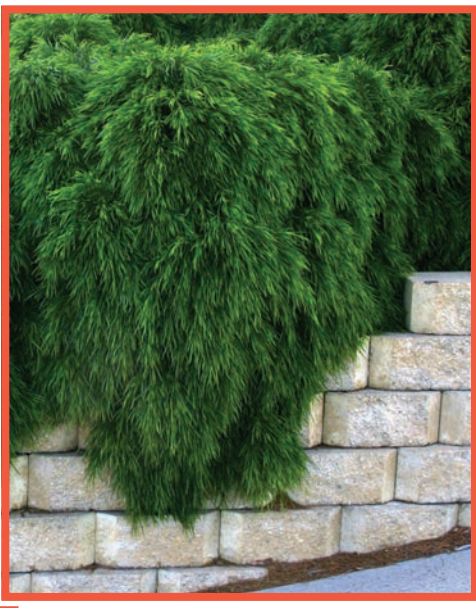
Acacia cognata 'Cousin Itt', little river wattle

Other salvias to be available include Salvia leucantha 'Daniel's Dream', a new color form of Mexican bush sage, and Salvia munzii , Munz sage or San Diego sage. 'Daniel's Dream' is a