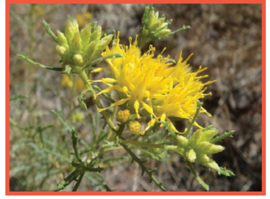
Ericameria laricifolia, turpentine brush