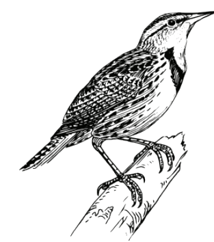
Saturday, May 7 Spring Migration

This trip will be for no more than 20 birders who want to learn some of the tricks of the trade and take the opportunity to see the migratory birds that should be in the Gardens at this time. We will start at 6:30 a.m. and then bird for two hours. We will target migrants such as Western Tanager, several warbler and vireo species, all three species of gold-finches, grosbeaks, Rufous and, if we are lucky, Calliope Humming-birds, and much more. We anticipate at least 35 interesting species.