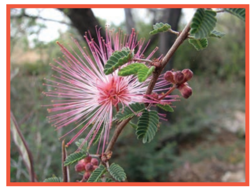
Calliandra eriophylla, fairy duster, photo courtesy of Melbumian.

or desert sunflower, photo courtesy of Stickpen. s e l e c t i o n, is evergreen and eal, more or less or large shrub to moderate irrigating in youth, but