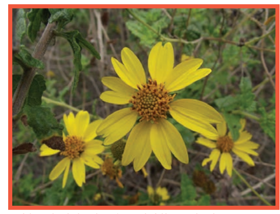
new to the sales. Bahiopsis (Viguiera) parishii, Parish's goldeneye will offer the Cuprassus forba, or desert sunflower, photo courtesy of Stickpen. See lee cition

Among the California native shrubs to be available is Bahiopsis parishii (aka. Viguiera parishii), Parish's goldeneye, or desert sunflower. This is a three-foot, much-branched, more or less evergreen shrub with triangular, shiny, green leaves and 1.5-inch, yellow daisy flowers in spring, and fall with some irrigation. One of our prettiest desert natives is fairy duster, Calliandra eriophylla, and it is rarely seen in nurseries. It is an adaptable, mostly evergreen shrub growing to three feet tall. As the common name implies, the spring flowers are delicate, rosy pink brushes of stamens and are set off by