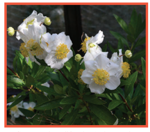
Carpenteria californica 'Elizabeth', bush anemone.

Continuing the Australian theme, we have fuchsia emu bush, Eremophila glabra 'Kalgoorlie'. Fuchsia emu bush is a low growing and wide spreading, evergreen shrub -- two to three feet high and three to eight feet wide. Its narrow leaves are gray-green and the orange, tubular flowers have flared petals and protruding stamens. Another evergreen, Australian shrub is Westringia fruticosa 'Blue Gem', coastal-rosemary. 'Blue Gem' is a