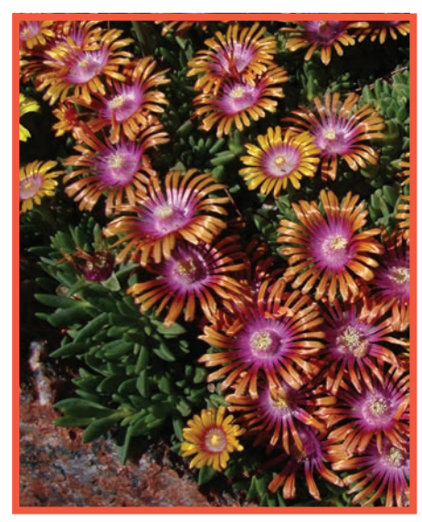
Delosperma 'Fire Spinner'