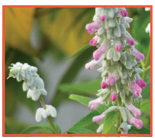
Salvia leucantha 'Daniel's Dream', Mexican bush sage

Among the water efficient herbaceous plants is Monardella macrantha 'Marian Sampson', hummingbird mint. This diminutive, California native perennial grows to only four inches tall and to 18 inches wide. The leaves are shiny dark green and showy clusters of tubular, bright red flowers with red calyces are produced in summer. This handsome plant will require bright partial shade and occasional summer irrigation in Inland gardens. It is especially nice in containers, where it also tends to have a longer life. Another diminutive, California native perennial is golden dyssodia, Thymophylla pentachaeta, which grows to only six inches tall and wide. It has dark green, needle-like leaves and yellow daisy flowers most heavily