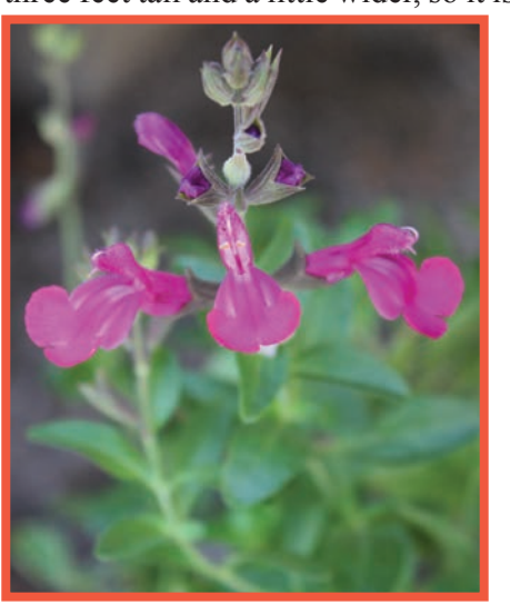
Salvia x jamensis 'Bob & Bernie'

rare California native, growing naturally in just a few sites, right near the Mexican border in San Diego County, and in northern Baja California in Mexico. This sage grows to only three feet tall and a little wider, so it is