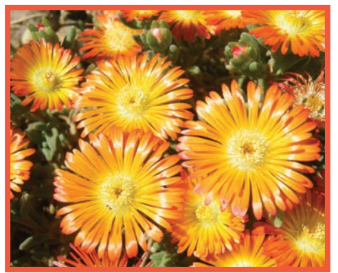
Delosperma 'Orange Wonder'

even the detailed list can't include everything. There are still many cacti and succulents in smaller sizes, hundreds of herbs, vegetables grown by the UC Master Gardeners, and wildflower seeds that will be available but are not listed. Plan to spend some time perusing the huge selection and visiting the Gardens, as well. Be sure to tell your friends and relatives about the sale. And don't forget -- the Friends Preview Sale begins at 8 A.M. Thank you in advance for your support of this great event and for your support of the Gardens.