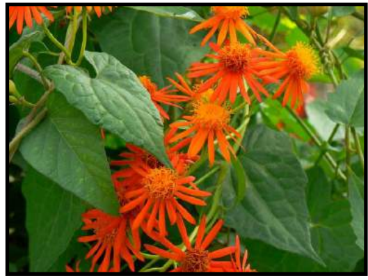
Senecio confusus, Mexican flame vine