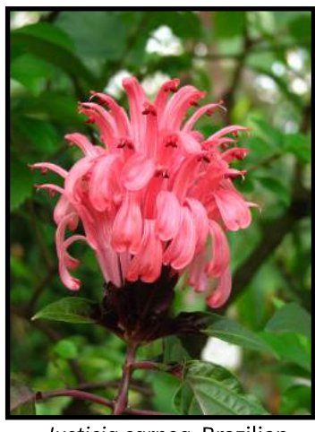
Justicia carnea, Brazilian plume