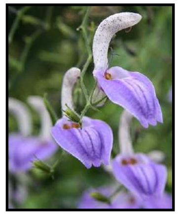
Brillantaisia, giant salvia

may even notice some graffiti on the wood. When you purchase one of these beautiful boxes you are truly taking home a piece of the Botanic Gardens. Below are more plants for sale that can tolerate our inland heat.