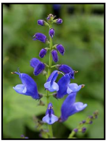
Salvia cacaliifolia, Guatemalan sage