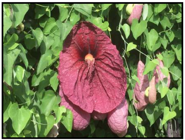
Aristolochia gigantea, Brazilian Dutchman's pipe

After the color and warmth of summer passes we enter my favorite season, fall. The plants in our garden work hard to put on a show of color, fragrance, and foliage in the summer months. They struggle through the heat, humid conditions, and sometimes wind. It is almost a relief to see these plants transition into fall for rest and rejuvenation. It is in fall that we begin to see the backbone of the garden in the form of a tree and its network of branches or a shrub and its beautiful bark that is normally hidden by leaves and bright flowers. It is also a time to enjoy the pink, white, and burgundy blooms of the Lagerstroemia indica, crape myrtle, along the driveway, and the glorious yellow blooms of the Cassia excelsa, crown of gold, that light up the slope near the Ficus grove. It's not always about color, as there are many sights that delight one's senses. The leaves from our deciduous trees form a beautiful patchwork of colors and textures throughout our temperate deciduous forest. Our most popular vine is the Aristolochia gigantea, Brazilian Dutchman's pipe, which covers a