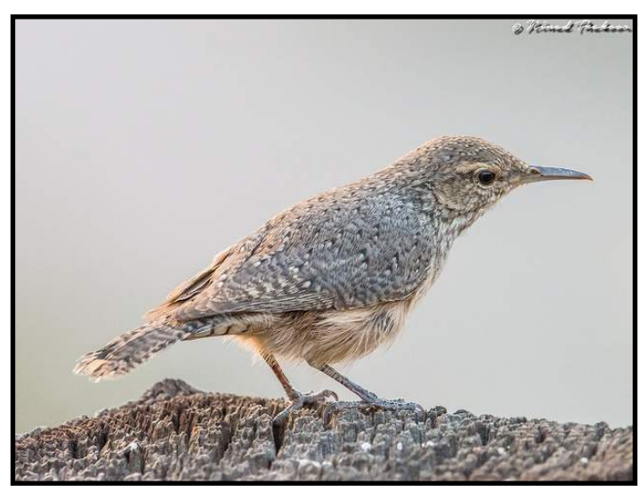
Rock Wren

The nest is a loose cup of grass, moss or hair, hidden up to a quarter meter within a cavity or crevice in the rocks, out of sight and safe from predators. The Rock Wren, presumably the male, exhibits the unusual habit of landscaping its abode by