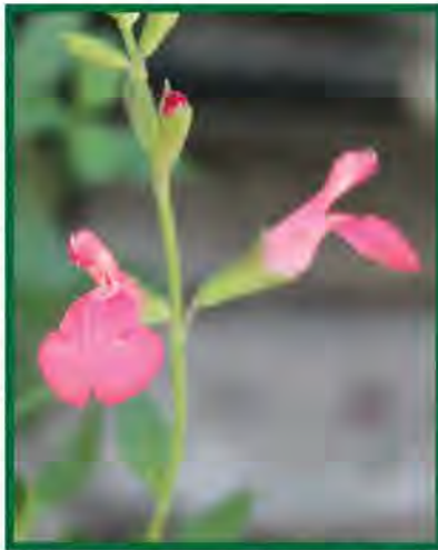
Salvia x jemensis 'Salmon Pink'

insects! The Department of Plant Pathology will be able to answer your plant disease questions. The