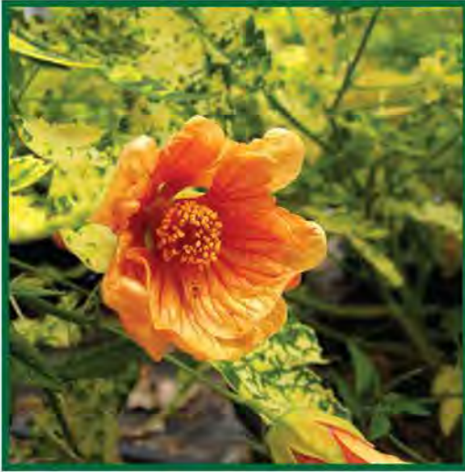
Abutilon pictum 'Aureo-maculatum'