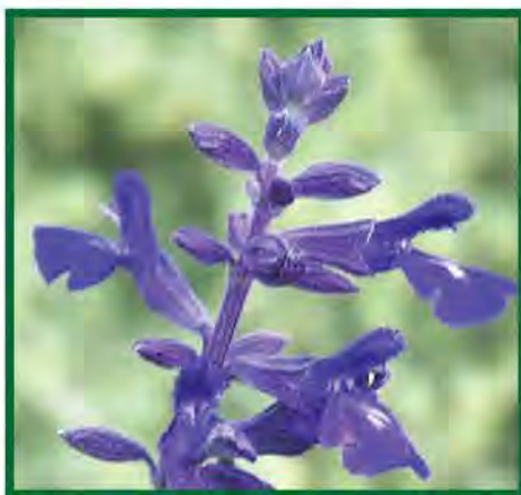
Salvia 'Indigo Spires'