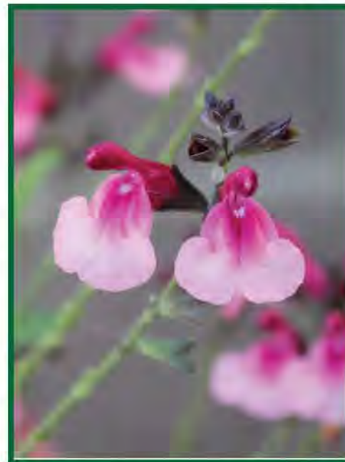
Salvia x jamensis 'Ann Platzer'