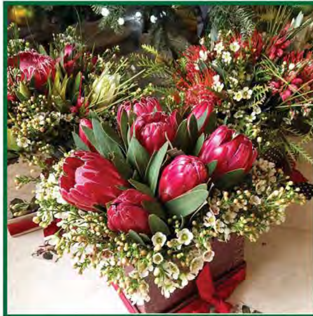
Flower Arrangement by Resendiz Brothers

Wild Birds Unlimited will bring just about everything related to birds including seed, houses, bird baths and accessories.