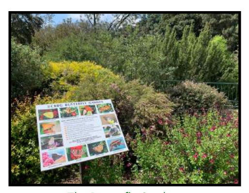
The Butterfly Garden