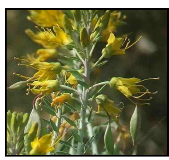
Peritoma (Isomeris) arborea, bladderpod

With pathways, irrigation, and plants in place we are now ready to create plant and interpretive signage. The Native American