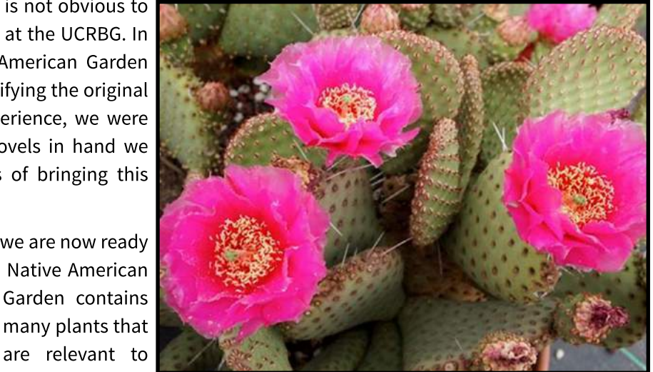
Opuntia basilaris, beavertail cactus

When we transition to a better time and we open our gates to our valued visitors, please include the Native American Garden in your places to see. The Native American Garden's beauty and purpose will patiently await your presence and appreciation.