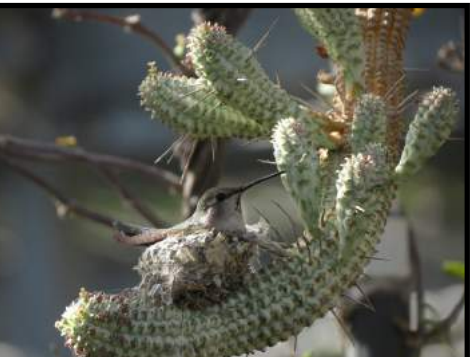
A hummingbird enjoying the quiet Gardens

When allowed by state and local authorities and UCR, Phase 2 will be launched with some restrictions eased but still following recommendations for facial masks, physical distancing, and group size and capacity limits.