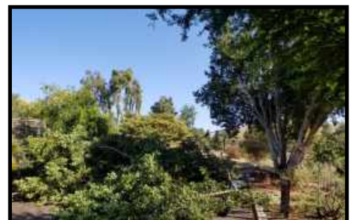
Fallen portion of the multi-trunked sweet bay tree, Laurus nobilis , in the Herb Garden