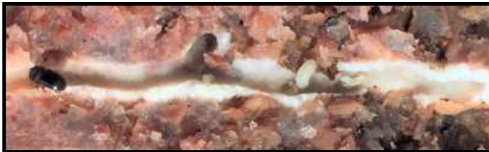
Fusarium lined tunnels in artificial diet. Adult female far left, various larval instars along the tunnel.

In reproductive host species, in which the beetle can complete its life cycle, an adult beetle burrows into a tree and creates a network of galleries that it inoculates with ectosymbiotic fungi. The adult beetles and developing larvae feed on the fungi, and a new generation of beetles is produced. The newly developed beetles may emerge from the tunnels and re-infest other parts of the same tree or move to other hosts nearby.