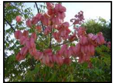
Photo 3: Papery fruit of Koelreuteria bipinnata , golden rain tree

The second species to see now is native to southwest China and is sometimes referred to as the Chinese flame tree. We have two large golden rain trees, one on each side of the trail that leads to Alder Canyon (Photo 2). These trees have a decurrent growth and have spread out to cast wide shade. In the upcoming weeks, a profusion of tiny yellow flowers set on panicles will envelop the crowns. Following this display, the tree will be adorned with pink papery seed capsules, which is an equally impressive sight (Photo 3). As a last show of splendor, all the leaves will turn yellow before dropping to the ground in this winter deciduous species. This tree is truly wonderful to see but you will have to come more than once to see the colorful progression as we get into cooler weather.