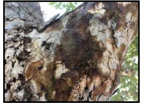
Palo verde tree with dark staining

Although researchers continue to study different methods for chemical and biological control, early detection is the key to controlling this pest. So far, no effective preventative treatments have