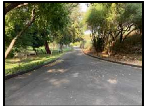
The newly repaved main road